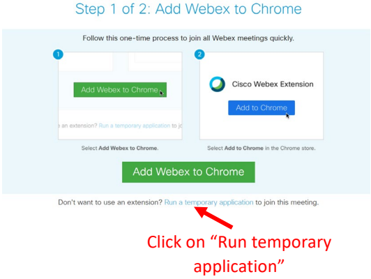
4. Once the application is downloaded, it will connect you to the session.

3. You may come to a screen that will ask you to install a temporary application. Click on Run temporary application .